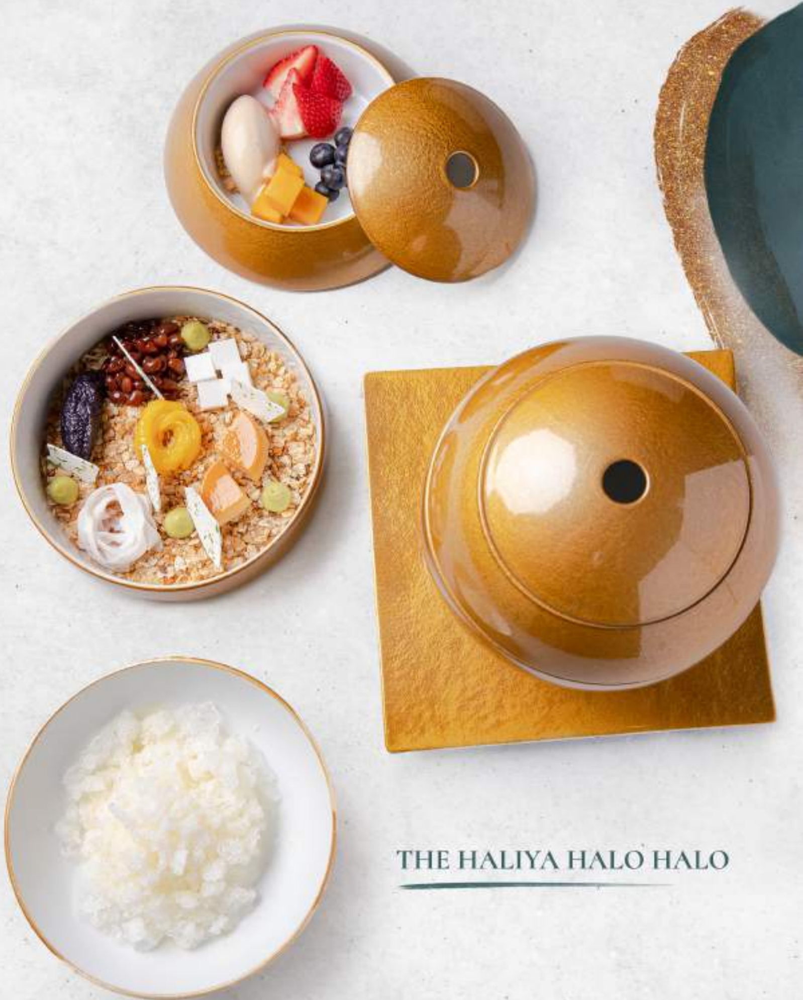
THE HALIYA HALO HALO