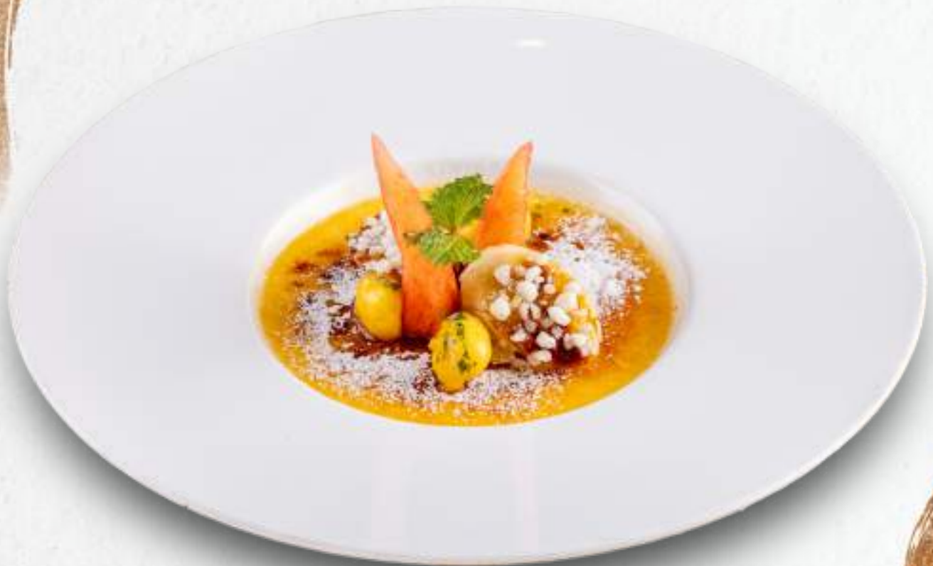
HALIYA CRÈME BRÛLÉE