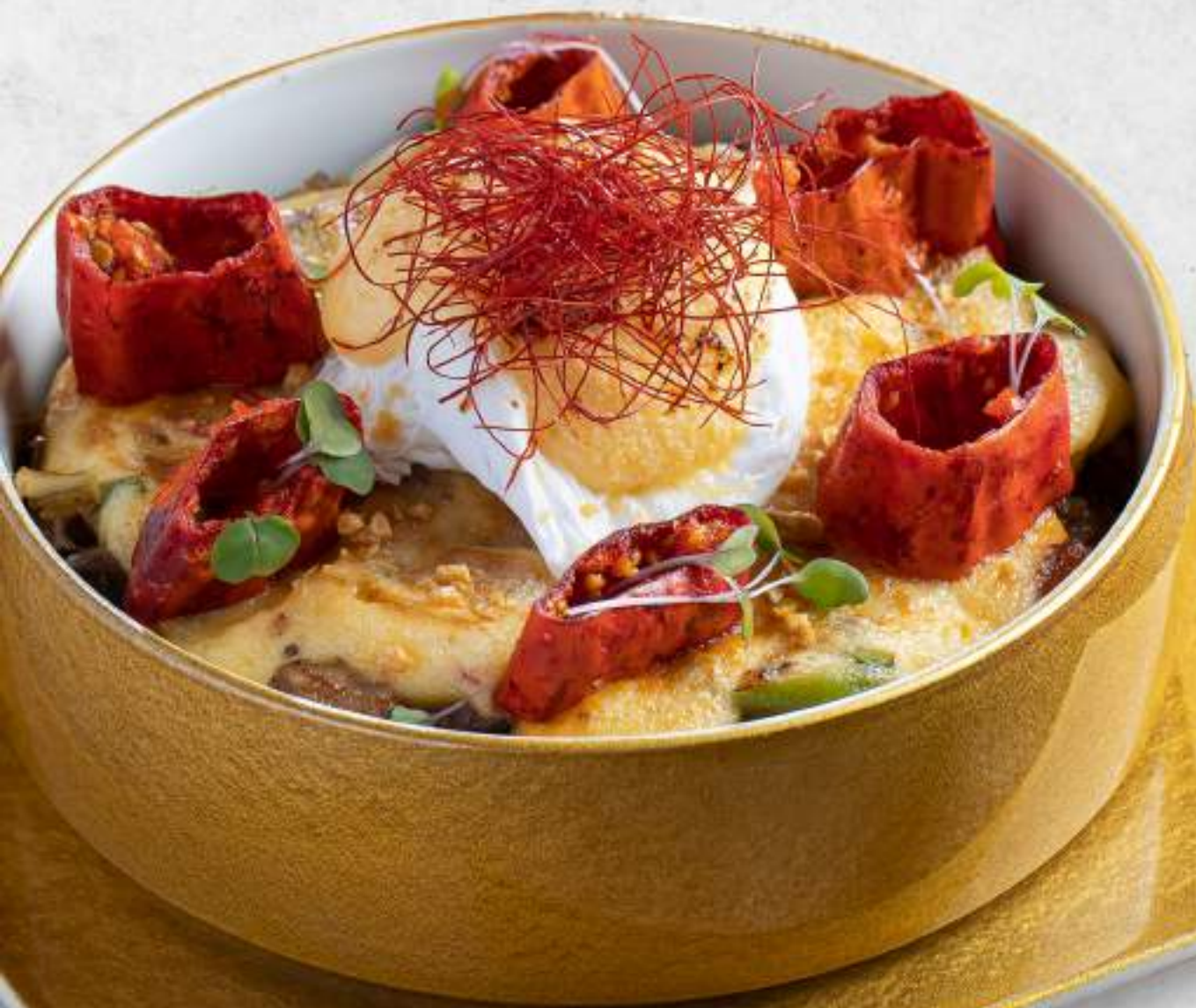
BAKED PORK SISIG