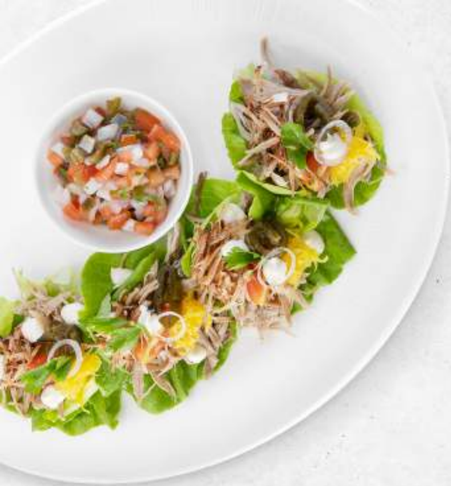
BINALOT NA COCHI